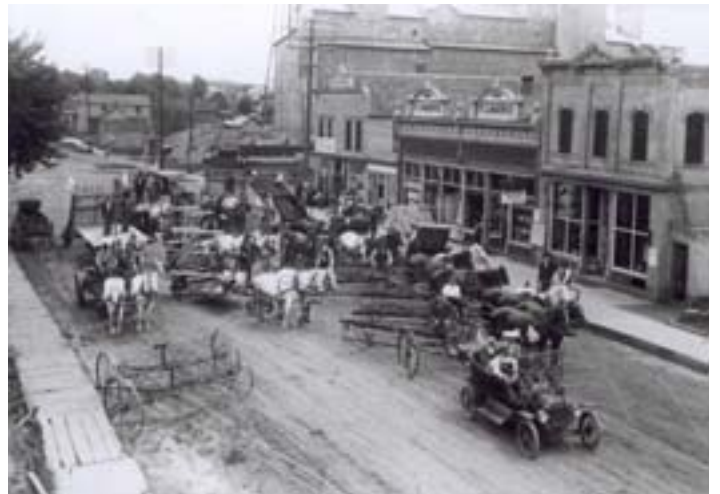
Delivery day at Mamer & Deutsch Hardware Store around 1914.