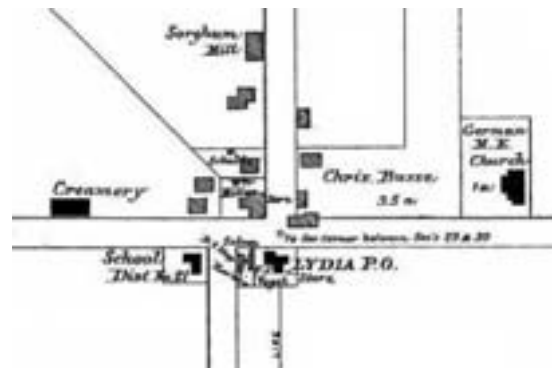
Platbook of Scott County. Northwest Publishing Co. 1898