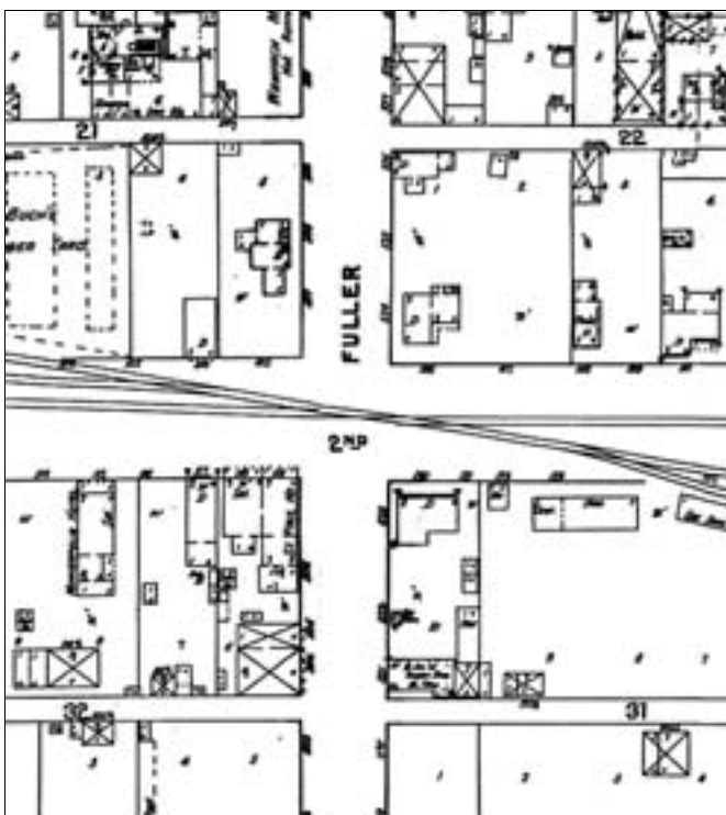
Shakopee 1895, Sanborn-Perris Map Co. Ltd.