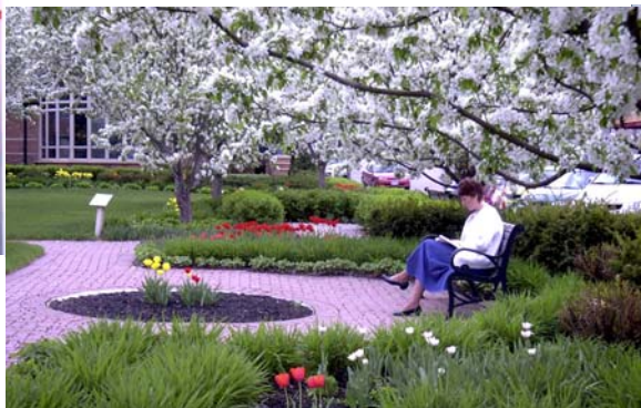
Springtime in the garden.