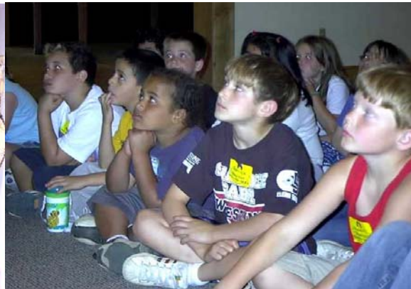
Pearson Elementary 2nd graders at the museum.