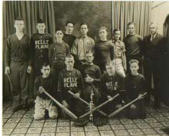
1937 Belle Plaine High School District 13 Champions