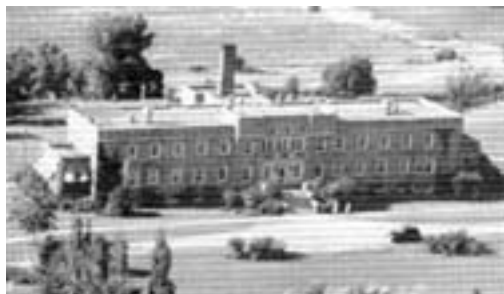
Reformatory, 1937.

Tom will speak at the Stans Museum on September 29 at noon and again on September 30 at 6:30 p.m. The book, For the Good of the Women, A Short History of the Minnesota Correctional Facility, Shakopee , is now available at the Stans Museum for $10.00.