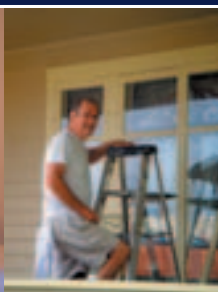
Painting Stans House