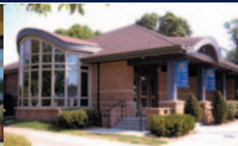
SCHS - Stans Museum