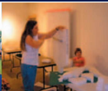
Clothing Mount Workshop