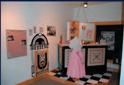
Read All About It exhibit Soda Fountain