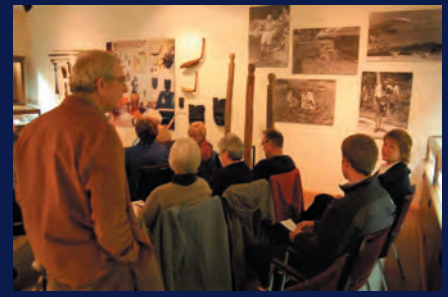
MHS Preservation workshop